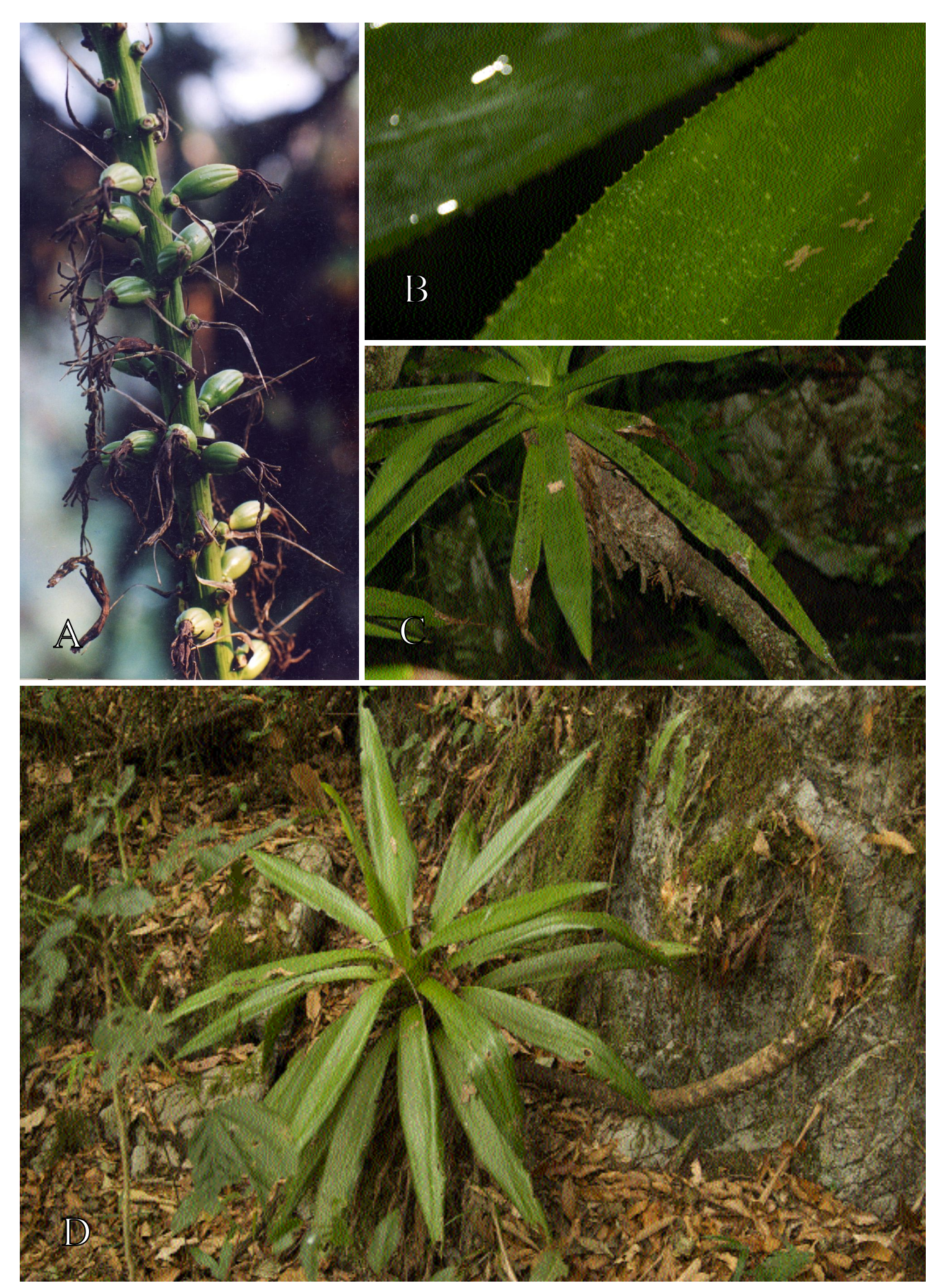
Fig. 2 Agave gomezpompae Cházaro & Jimeno-Sevilla. A . detail of inflorescence ; B. detail of the leaf denticulation ; C . detail of stem; D . habit.