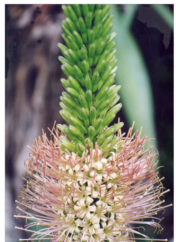
Agave gomezpompae, infl., habitat, Mexico Agave gomezpompae, infl., habitat, Mexico