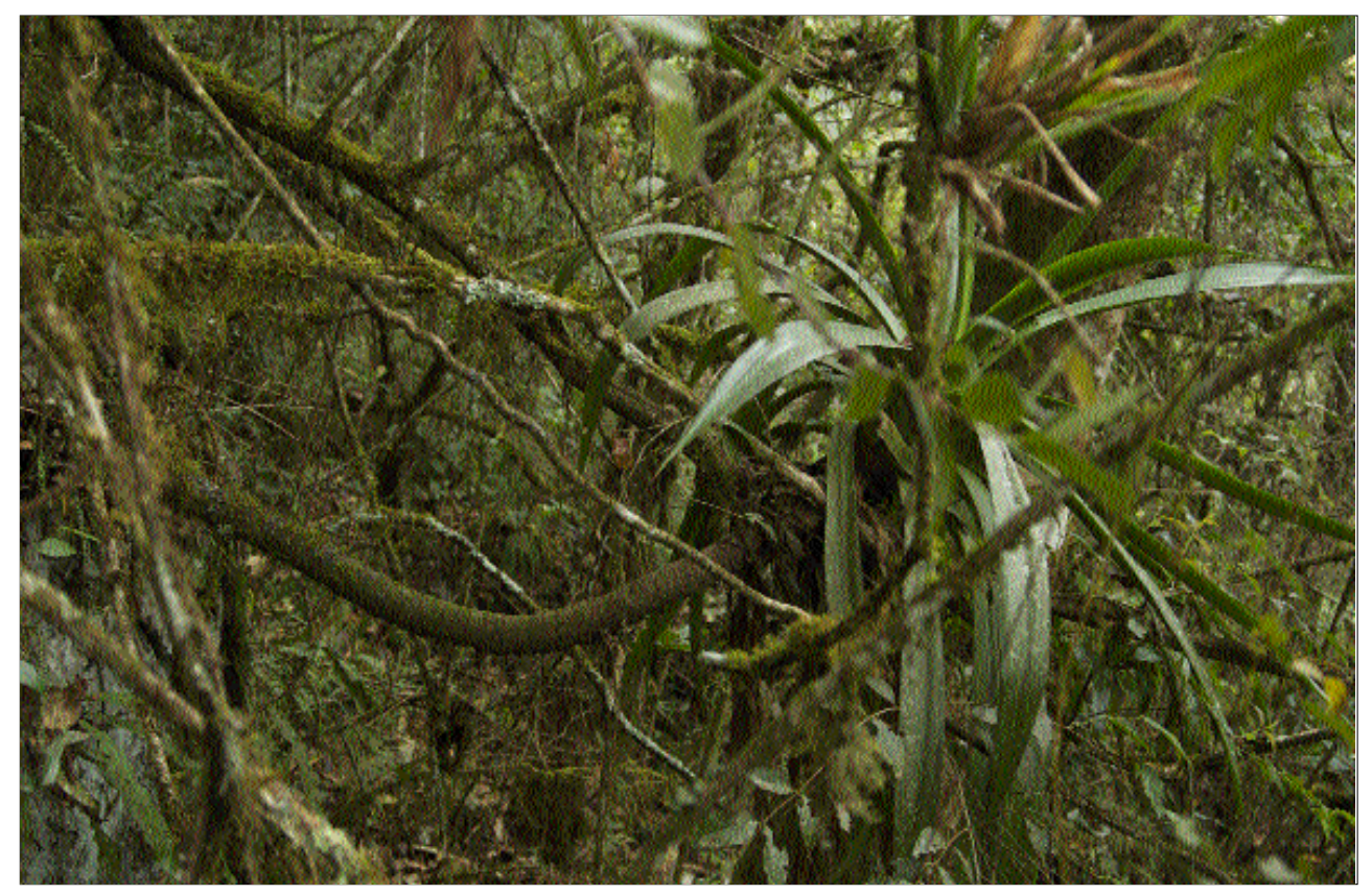
Agave gomezpompae, habitat.

of Mexico, in Mexico city, that later on became the national collection of Agavaceae and Nolinaceae.