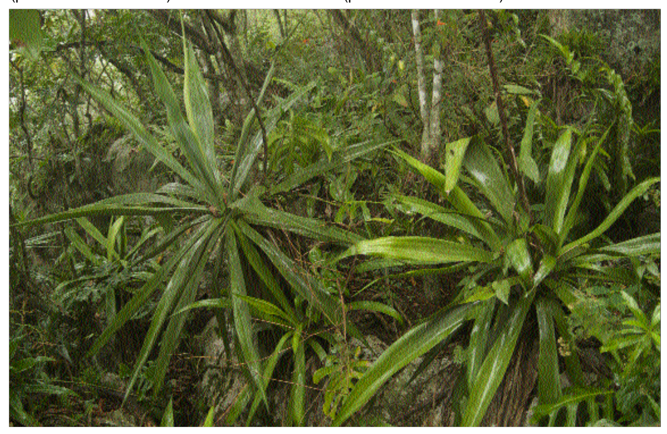
Agave gomezpompae, habitat, Mexico.